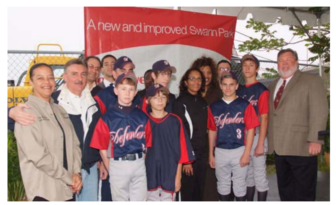
fenders Baseball Club in South Baltimore join Honeywell, state and city officials to celebrate the groundbreaking of their park.