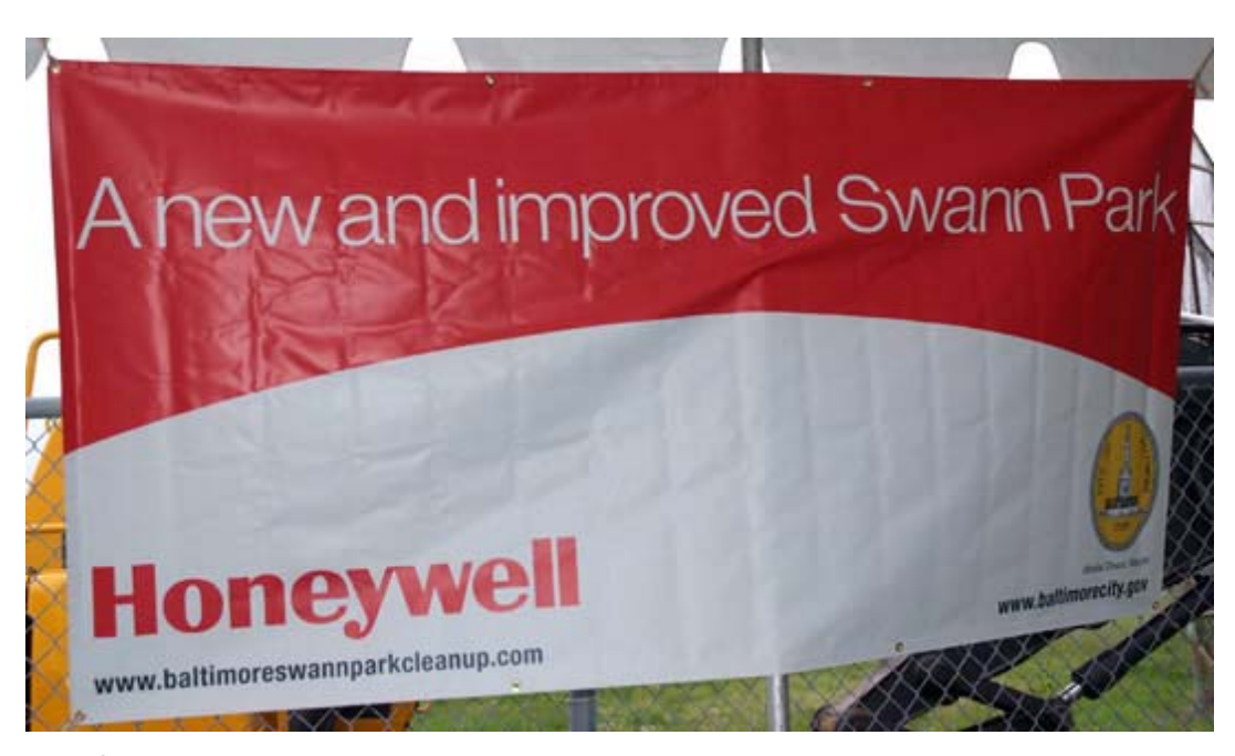
When Swann Park reopens, it will feature improved lighting, ball fields, pedestrian pathways and other enhancements.