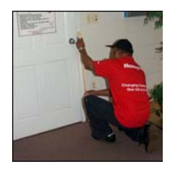
On April 26, Honeywell volunteers partnered with Rebuilding